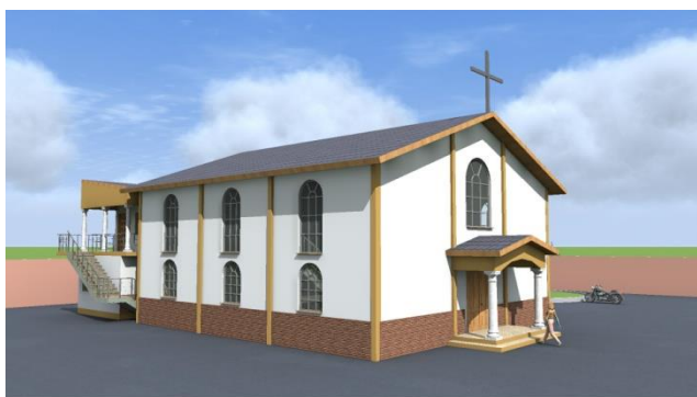
Blueprint of Nazareth UMC projected building

Nazareth UMC is the youngest of all the UMC parishes in Yaoundé. This church that has less than 50 members has demonstrated exceptional spiritual maturity and commitment. Inaugurated in September 2015 in Olembe neighborhood, it has acquired its own piece of land in Nkooza neighborhood where it has moved in August 2016; that is one year after its inauguration. It is the members of this parish who have made it possible for them to own this property where they want to erect their worship space soon. They have already contacted an architect who has already drawn the plan of the building that will have the sanctuary, an office room and a Sunday school room.