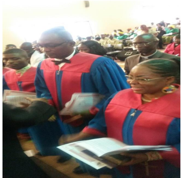
Newly commissioned lay preachers greet Church leaders

We have 11 departments that work actively for the development of our church in this nation: 1) Christian Education department; 2) Youth and Young Adults ministries; 3) Music ministries; 4) Women ministries; 5) Men ministries; 6) Health department that comprises the promotion of malaria and HIV/AIDS awareness, and a mobile eye clinic; 7) Prison ministry; 8) Microfinance; 9) Volunteers in Mission; 10) Projects and development; 11) Evangelization.